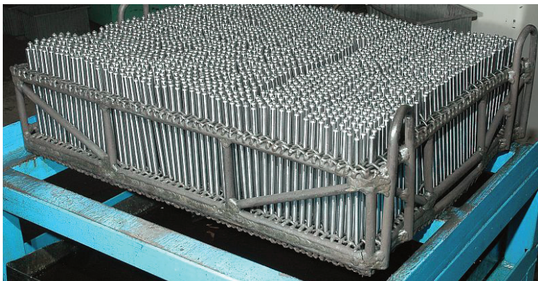
Trend pushrods are stacked in specially constructed stainless-steel racks within 2 degrees of vertical to ensure they remain straight during the heat-treating process, where temperatures reach 1,700 degrees.

It may seem peculiar now that Diamond, who